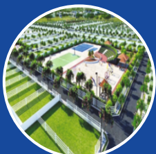
READY TO MOVE PLOTS