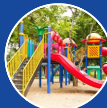
KID'S PLAY GROUND